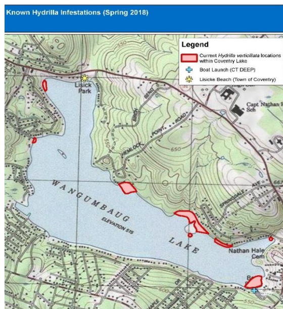
Known locations of hydrilla at Coventry Lake (Wangumbaug Lake). Boaters should avoid these areas noted with red to avoid fragmenting and spreading hydrilla.

CONNECTICUT RIVER (invasive species alert). In 2016 hydrilla was found in the main stem Connecticut River in Glastonbury (near Glastonbury's Riverfront Park & Boathouse). Last year hydrilla was found at other