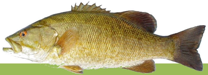
Smallmouth Bass ( Micropterus dolomieu )